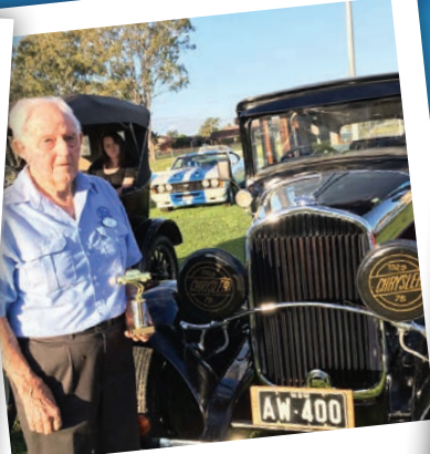
Taree Historic Motor Club