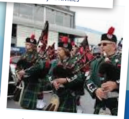
Wingham Pipe Band